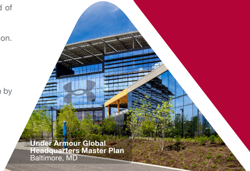
Under Armour Global Headquarters Master Plan Baltimore, MD

Continuous Quality Improvement at Kimley-Horn means learning to do something better today than we did yesterday.