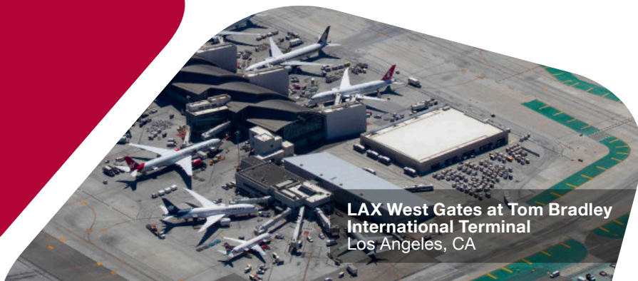
LAX West Gates at Tom Bradley International Terminal Los Angeles, CA

With experience in renewable energy sources—solar, wind, and biomass—and nonrenewable sources—oil and gas—our forward-thinking energy team guides clients through increasingly complex regulatory processes.