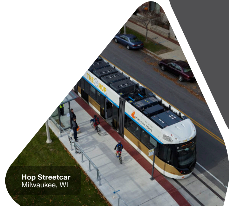
Hop Streetcar Milwaukee, WI