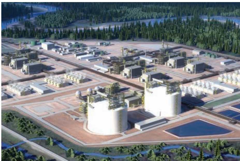
EXPORT FACILITY LNG produced in British Columbia will be destined for Asian markets.