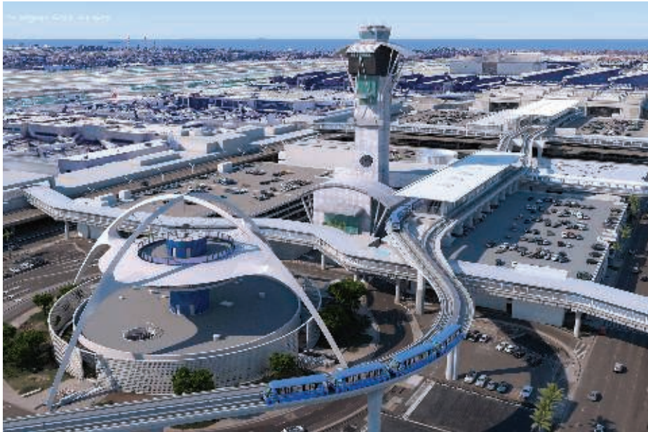
DESIGN INNOVATIONS LAX's new people-mover system is being designed around existing parking structures.