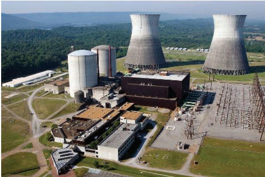
BELLEFONTE Nuclear Development has an agreement to purchase a nuclear plant from TVA for $111 million.