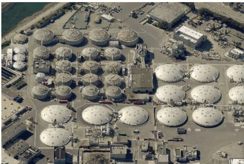
INCREASE An upgrade to equipment will expand Orange County Plant to 130 million gallons per day.