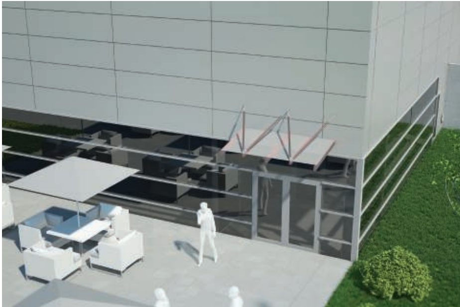
LARGEST PLANT First Solar's Ohio module facility will produce thin film PV panels.