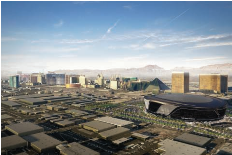
DOMED VIEWS The Raiders' stadium features horseshoe seating open on one end for views of Las Vegas.